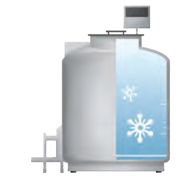
Computer Controlled-Rate Freezing